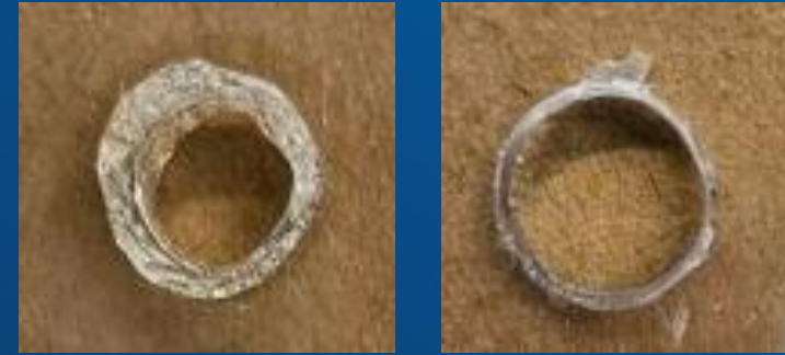
Figure 3: Sauter versus Drill Testing on Polycarbonate Sheets