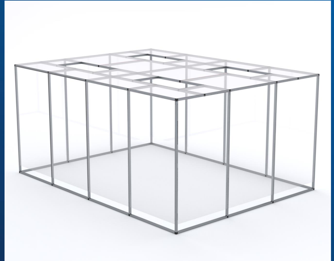
Figure 2: Fully modeled CAD Render of 12x16 Cleanroom