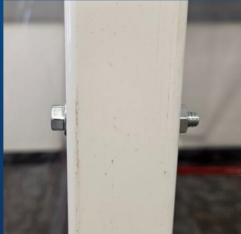
Figure 5: Steel Beam Holes